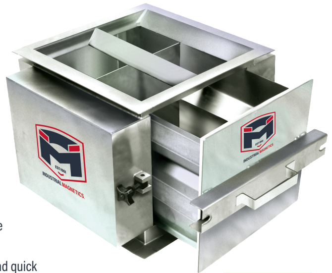
EZ-Clean Extractor Shown Above

Standard models are equipped with an EZ-clean stripper drawer to easily remove collected metal from the housing (metal must only be removed from the housing while the line is shut down). Extractors are also available in air-actuated self-cleaning models for automated or remote cleaning.